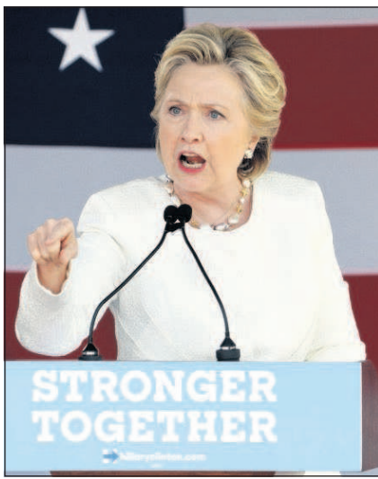
LEFT: Republican presidential candidate Donald Trump gestures Tuesday during a campaign rally at the University of Wisconsin-Eau Claire. RIGHT: Democratic presidential candidate Hillary Clinton gestures Tuesday during a campaign speech in Dade City, Fla.

and fall tearing Trump down, Clinton had planned to close the campaign on a more positive note. She talked about giving Americans something to vote for, not just against. And with public opinion polls showing her with solid leads in most battleground states, she started talking about healing divisions and unifying the country after the election.