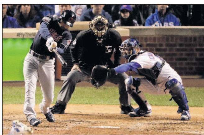
Cleveland's Coco Crisp hits a RBI-single against the Chicago Cubs during the seventh inning of Game 3 of the World Series Friday, Oct. 28, 2016, in Chicago.