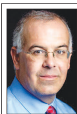
DAVID BROOKS Comment

Clinton has contributed to the degradation too. As the James O'Keefe videos remind us, wherever Hillary Clinton has gone in her career, a cloud of unsavory people and unsavory behavior has traveled alongside. But she is right to emphasize that Trump is the greatest threat to moral capital in recent history and that the health of that capital is more fundamental than any particular policy position.