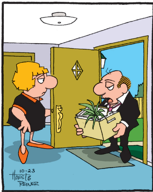
"THE BOSS FOUND OUT THAT I WAS THE ONE CONSTANTLY BEATING HIM AT ONLINE POKER."