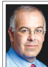
DAVID BROOKS Comment