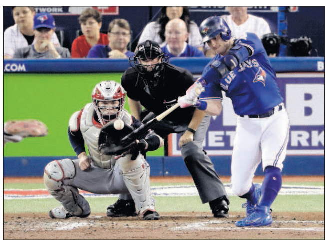
Toronto Blue Jays' Josh Donaldson hits a home run against the Cleveland Indians during the third inning in Game 4 of the ALCS on Tuesday in Toronto.

Cleveland will try again Wednesday to win to earn its first World Series trip since 1997, but the big concern for the Indians coming into the