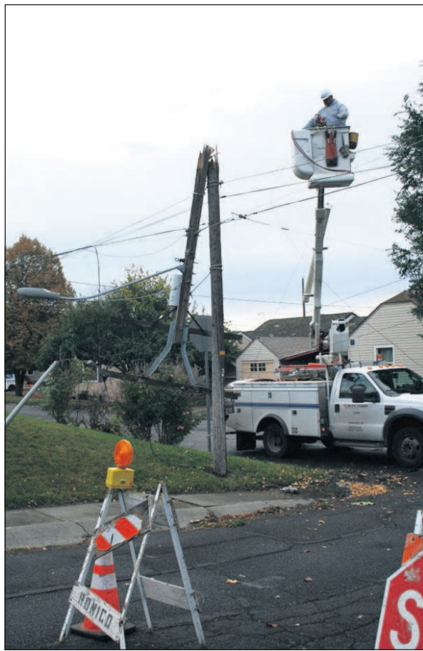
A power pole snapped in the wind sometime early Friday morning at the corner of 10th and Gilliam on Pendleton's North Hill.

The wind whipped up to 78 mph at CBARC, about 9 miles east of Pendleton, uprooting trees and damaging a greenhouse on the property.