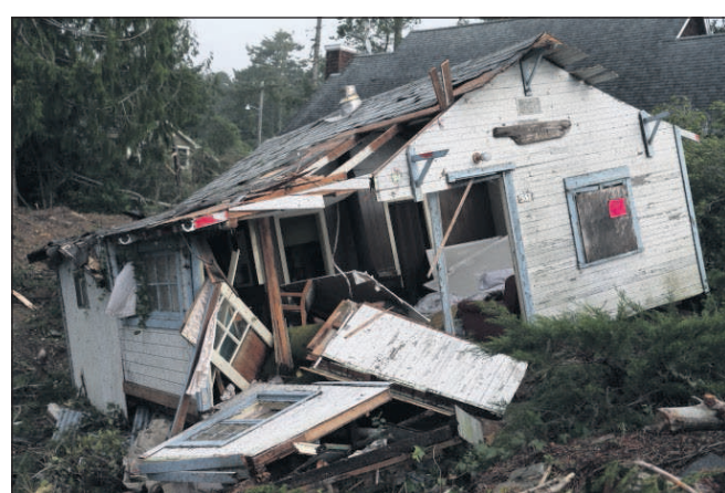
Debris is strewn about after a tornado struck Manzanita on Friday.