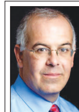
DAVID BROOKS Comment

In this way, Trump seems to be denied all the pleasures that go with friendship and cooperation. Women could be sources of love and affection, but in his disordered state he can only hate and demean them. His attempts