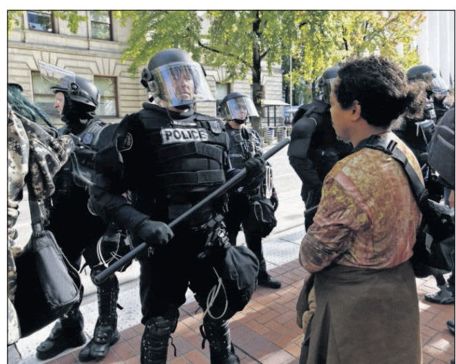
Portland Police stand guard near demonstrators outside City Hall in Portland Wednesday.