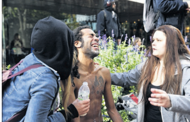
An unidentified demonstrator receives relief after the deployment of pepper spray when the Portland Police faced off with protesters after the city council voted on a new contract with the police union, Wednesday. Milk is used to help alleviate the effects.