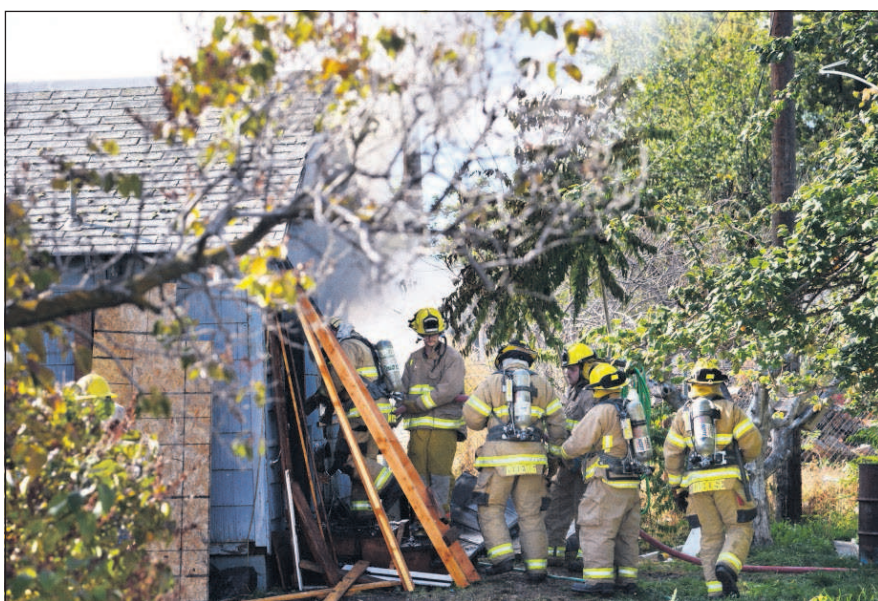
Pilot Rock and Pendleton firefighters work to extinguish a fire at a residence Monday on Southwest Birch Street in Pilot Rock.