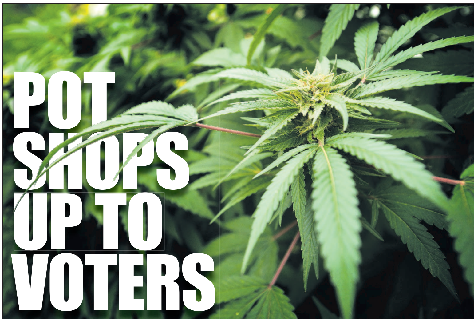
Residents in the municipalities of Pendleton, Hermiston and Milton-Freewater will have the opportunity to vote on whether or not to allow both medicinal and recreational marijuana dispensaries into their communities on the November ballot.