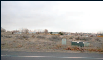
4.54 ACRES BARE LAND IN IRRIGON ready for development. Zoned R2 residential. May be sold with MLS# 14511892 and MLS# 14355248. MLS# 14267289 $35,000