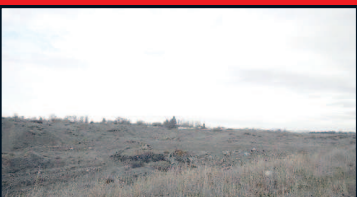
21.55 ACRES BARE GROUND IN THE CITY OF IRRIGON ready for development. Zoned for residential development. MLS# 14352202 $129,000

GREAT FRONTAGE LOCATION for a retail business in Stanfield. Possibilities are endless. RMLS# 16680952 $109,000