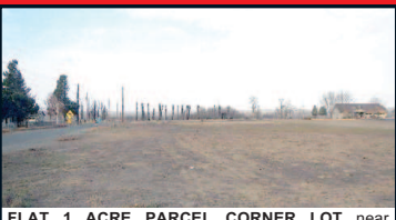
FLAT 1 ACRE PARCEL CORNER LOT near Columbia River on access route to beach with River view. Build your custom home near the river! This area along the River is rare and when it's gone it's gone. If you have looked for a country setting with quick beach access to build your home, this could be your spot! $49,000 MLS# 14245837

COMMERCIAL LOT AT BOARDMAN CITY CENTER! .63 acres with approximately 128ft of front footage. This is a professional location with City Hall, Bank, Medical and County offices existing and multiple possible uses for your planned business! RMLS# 16284686 $72,000