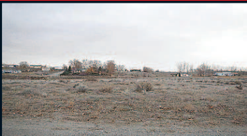
4.13 ACRES BARE LAND IN IRRIGON in the city which are ideal for development into new residential lots. Zoned R2 residential. May be sold with MLS# 14355248 and MLS# 14267289. MLS# 14511892 $35,000

NICE VIEW LOT OVERLOOKING THE UMATILLA RIVER. 0.32 of an acre with all utilities at the street. MLS# 16351199 $19,000