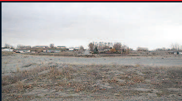
4.13 ACRES BARE LAND IN IRRIGON in the city which are ideal for development into new residential lots. Zoned R2 residential. May be sold with MLS# 14511892 and MLS# 14267289. MLS# 14355248 $35,000

This home features a small fruit orchard to go along with the 1.58 acres. Several out buildings for the project minded person. Chicken coop and mature trees on this property. Inside you will find a very well kept home with some extra space that has been added off the back side of the home. RMLS# 16044306 $79,900