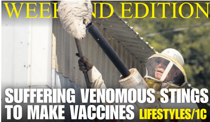
SUFFERING VENOMOUS STINGS TO MAKE VACCINES LIFESTYLES/1C