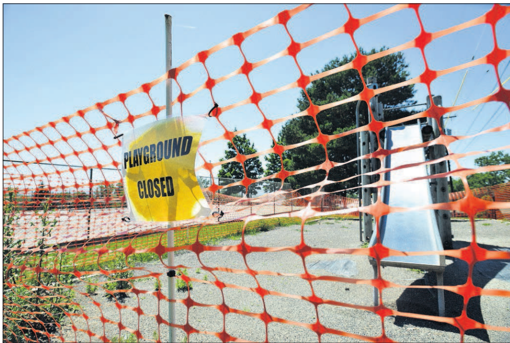
In this June 6 file photo, an orange construction barrier surrounds the play structure at Vincent Park in Pendleton.

Cook has said the playground at Sherwood Park also needs to be replaced, although it hasn't been closed yet.