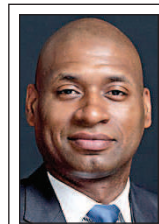
CHARLES BLOW Comment

don't talk nearly enough about the fact that choices are always made within a cultural and historical context.