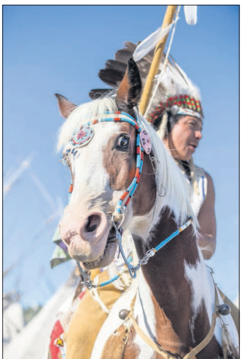
A horse seems to smile Saturday as it waits to enter the Pendleton Round-Up Arena.