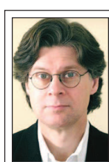
BYRON YORK Comment

One common theme of all the questions: They focused on things Clinton did in her years in office, in the Senate and as secretary of state. She started out by citing her experience, so Lauer and the audience answered, in effect, "OK, let's talk about your experience."