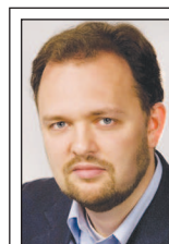
ROSS DOUTHAT Comment

But now it's a muddle. In the Middle East, throughout the Arab Spring and its aftermath, Washington has remained revisionist while Moscow has labored at realpolitik, seeking