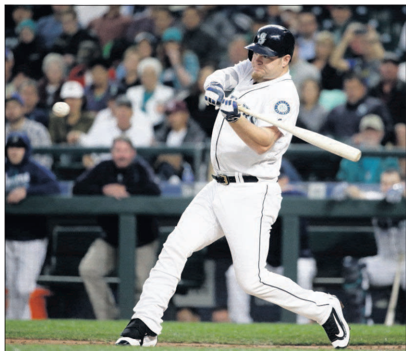
Seattle Mariners' Adam Lind swings for a grand slam against the Texas Rangers in the first inning of a baseball game Wednesday, Sept. 7, 2016, in Seattle.