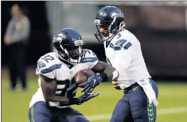
Seattle Seahawks quarterback Russell Wilson (3) hands off to running back Christine Michael during the first half of a preseason NFL football game against the Oakland Raiders on Sept. 1, 2016, in Oakland, Calif.