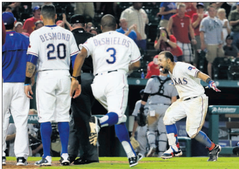
Texas Rangers' Rougned Odor, right, celebrates after hitting a walk-off two-run home run in a baseball game against the Seattle Mariners on Tuesday, Aug. 30, 2016, in Arlington, Texas.