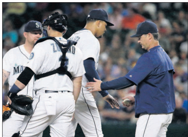
Seattle Mariners manager Scott Servais, right, pulls starting pitcher Taijuan Walker, second from right, from a baseball game against the New York Yankees during Tuesday's game in Seattle.