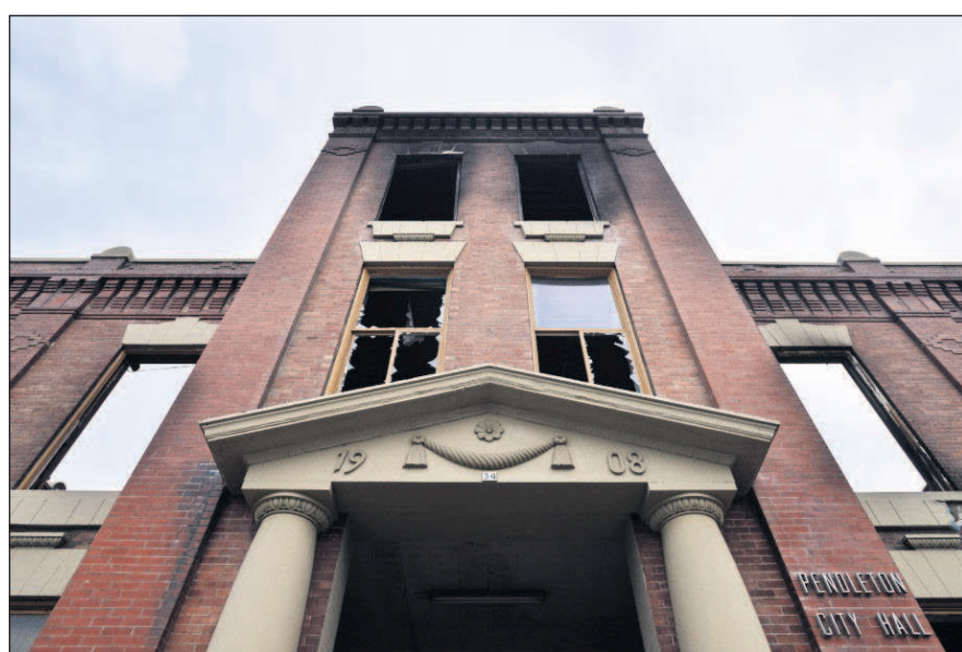
An explosion and fire gutted the old City Hall building in Pendleton on July 21, 2015.

Whether or not the Quezada family accepts the commission's proposal,