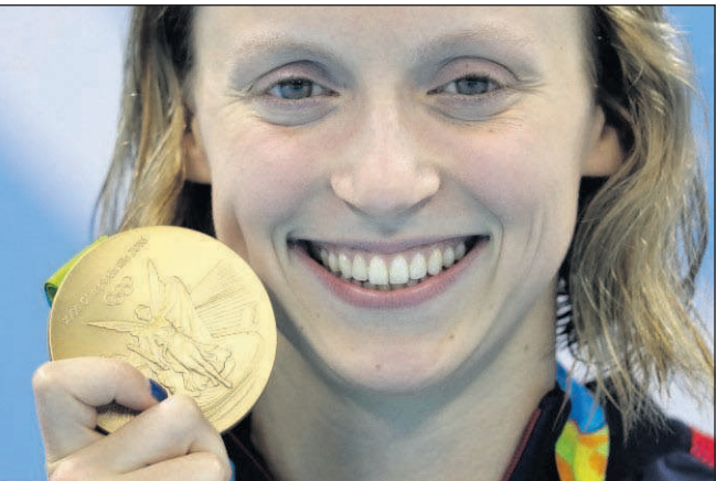
United States' Katie Ledecky shows off her gold medal in the women's 800-meter freestyle medals ceremony at the 2016 Summer Olympics, Friday, Aug. 12, 2016, in Rio de Janeiro, Brazil.

The 19-year-old continues USA's reign in the Rio pool