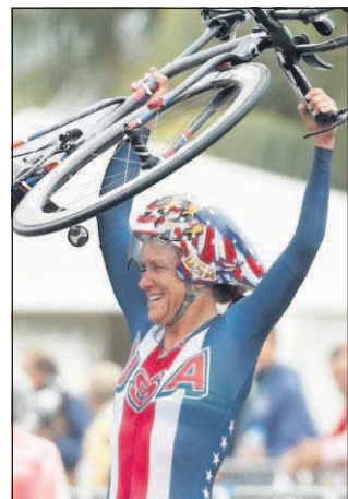
Cyclist Kristin Armstrong of the United States celebrates after crossing the finish line to win the women's individual time trial event at the 2016 Summer Olympics in Pontal beach, Rio de Janeiro, Brazil, Wednesday, Aug. 10, 2016.