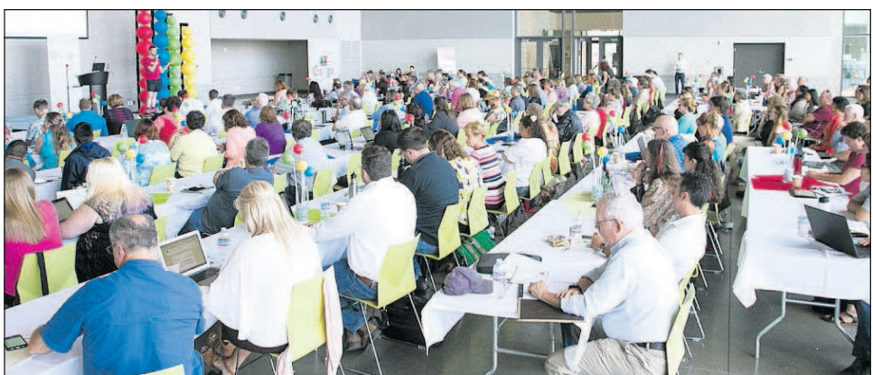
More than 300 participants attended the Aug. 2 Googlefest in The Dalles.