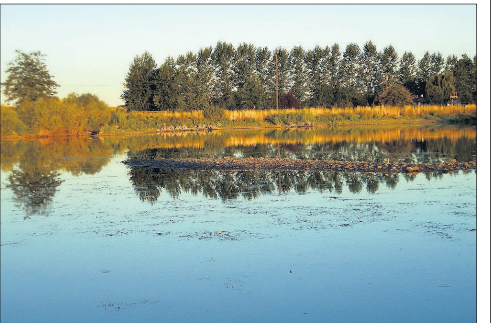
Pendleton photographer catches pond reflections

For more information, visit www.events.withgoogle.com/googlefest-oregon .