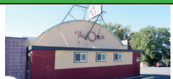
85698 HWY 339, Milton-Freewater The old "Oasis" restaurant. Great poten- tial. RMLS #15596076 $159,000