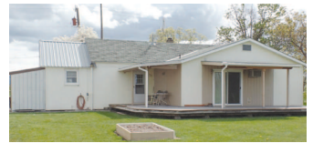
83652 Winesap Rd, MF 3Bd/2Ba 1,354 SqFt 0.57 Acres RMLS #16101080 $174,900