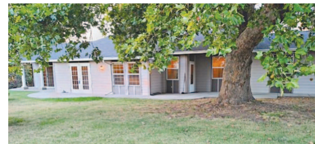
51934 Stateline Rd, MF 3Bd/2Ba 2,180SqFt. 0.71 Acres RMLS #15103353 $265,000