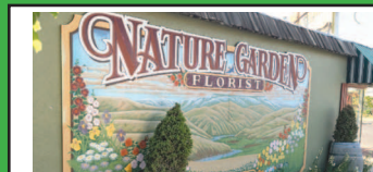
101 W Broadway Ave, MF "Nature Garden Nursery, right in the heart of Milton-Freewater!" RMLS #16475253 $160,000

Your Only Source FOR CUTTING EDGE MARKETING TECHNOLOGY: