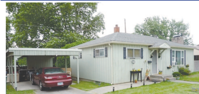
1027 Davis St, MF 3Bd/1Ba 2,140SqFt 0.11 Acres RMLS #16247852 $129,000