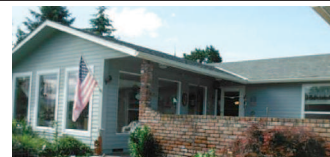
1028 Jacquelyn St, MF 4Bd/2Ba 2,268SqFt 0.26 Acres RMLS #15653327 $279,000