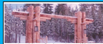
Lot 4 Lost Springs Lane, Weston 4.02 Acres RMLS #11653289 $105,000