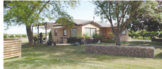
83872 Don Carlo Way, MF, 12.5 acres, Boutique Winery, RMLS# 16155422 $1,250,000