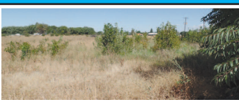
53671 Appleton Rd 12.5 Acres $280,000 RMLS# 16217860