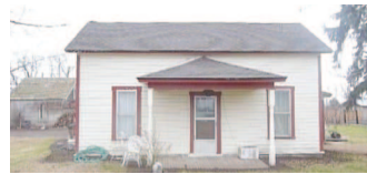
51561 HWY 332, MF 3Bd/1Ba, 1,535 SqFt 0.54 Acres RMLS #15322124 $59,900