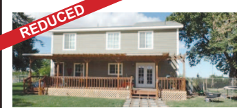
53671 Appleton Rd, MF 4Bd/2Ba 3,376SqFt 1.5 Acres RMLS #16643656 $268,000