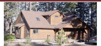
57865 HWY 204, Weston 3 bed rooms, 2.5 baths, 2878 sf 4.5 ac. RMLS #16026298 $349,000