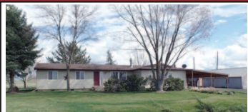
51421 HWY 332, Milton Freewater 5 beds, 2 bath, 2830 sq. ft., 4.85 acres RMLS# 16697487 $365,000