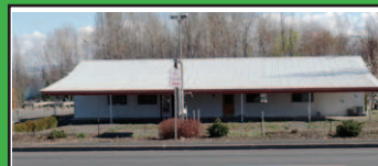
85019 HWY 11, MF 5.85 Acres, Commercial Opportunity with Tons of Traffic! RMLS #16120562 $395,000