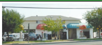
131 S Columbia St, MF 0.26 Acres - "Well Established carwash with apartment above, great income potential!" RMLS #14400253 $650,000