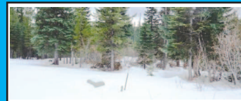
Lot 3 Lost Springs Lane, Weston 4.41 Acres RMLS #11339517 $95,000