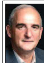
ROGER COHEN Comment

In no other nation is tomorrow so vivid, yesterday so pale. Where you came from yields to American rebirth. There is no real America to take back, as Trump insists, because America's many-hued reality is a ceaseless becoming. It is a mosaic in which