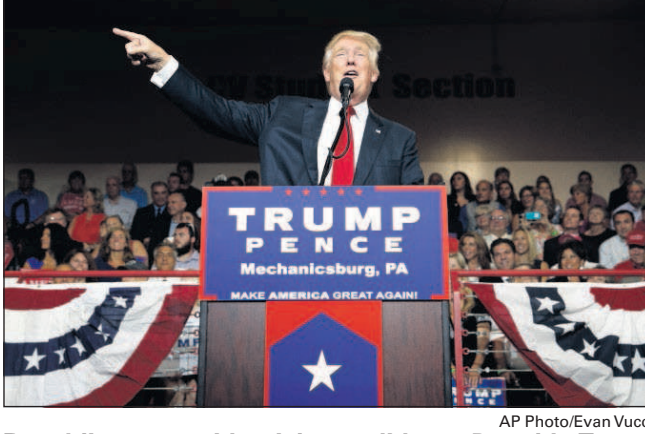
presidential candidate Donald Trump speaks during a campaign rally at Cumberland Valley High School, Monday, in Mechanicsburg, Pa.

In an emotional appearance at last week's convention, Khizr Khan criticized Trump for proposing to temporarily freeze the entry of foreign Muslims into the U.S. and accused him of making no sacrifices for his country. The billionaire businessman challenged that assertion and also implied Ghazala Khan's religion prevented her from