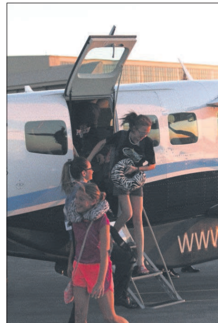
A few of the Pendleton 11/12-year-old softball all-stars deplane at the Eastern Oregon Regional Airport on Saturday in Pendleton.