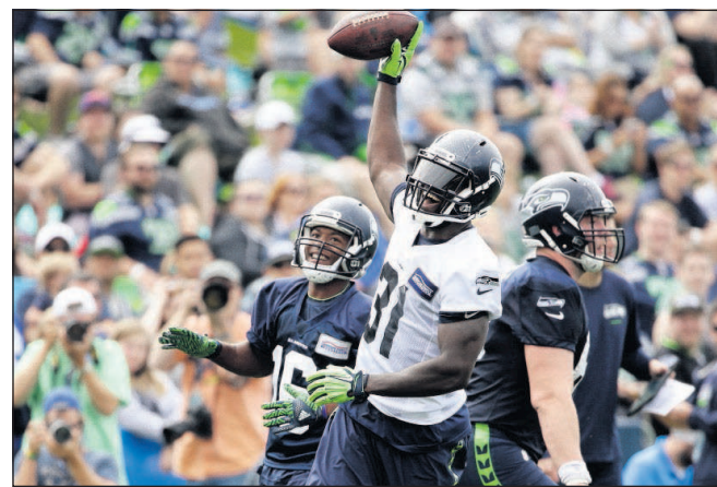
Seattle Seahawks' Kam Chancellor (31) raises the ball as he crosses the goal line after intercepting a pass during a scrimmage at the team's training camp Saturday, July 30, 2016, in Renton, Wash.