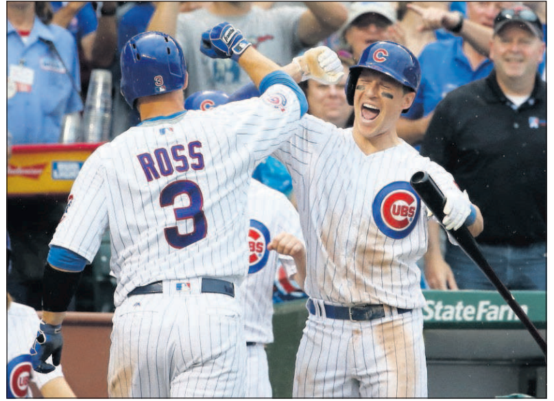
Chicago Cubs' Chris Coghlan, right, celebrates with David Ross (3) after Ross' home run during the sixth inning of Friday's game in Chicago.

"I'm OK, though. I just couldn't keep the ball down," Iwakuma said through a translator. Iwakuma (11-7) had won his last five starts, but gave up five runs and eight hits in three innings. "I don't think it's anything to be alarmed about, just took him awhile to get loose today, wasn't on top of his game," Mariners manager See MARINERS/2B