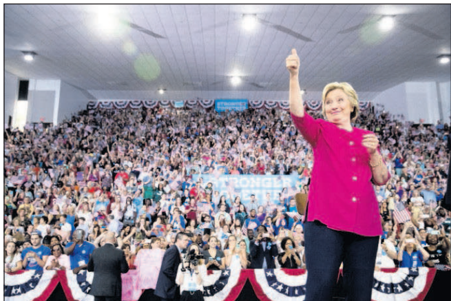
Democratic presidential candidate Hillary Clinton greets supporters as she arrives for a rally at McGonigle Hall at Temple University in Philadelphia, Friday. Clinton and Kaine are beginning a three day bus tour through the rust belt.