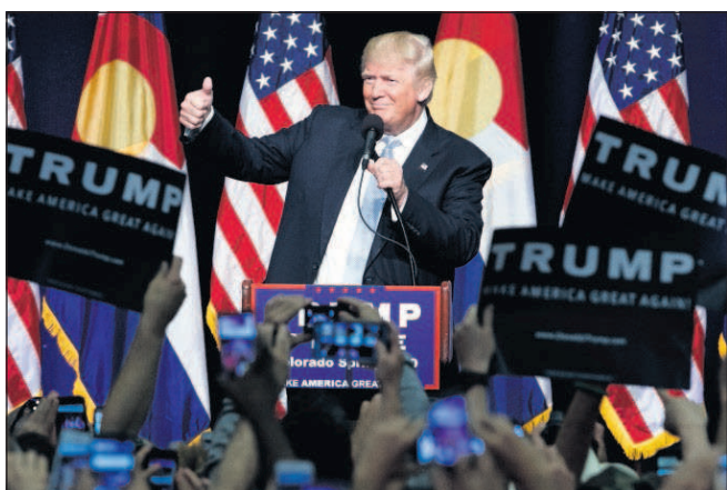
Republican presidential candidate Donald Trump gives a thumbs up as he speaks during a campaign rally, Friday, in Colorado Springs, Colo.

for the DNC hack, and the House Democratic campaign committee reported Friday that its information had been accessed.