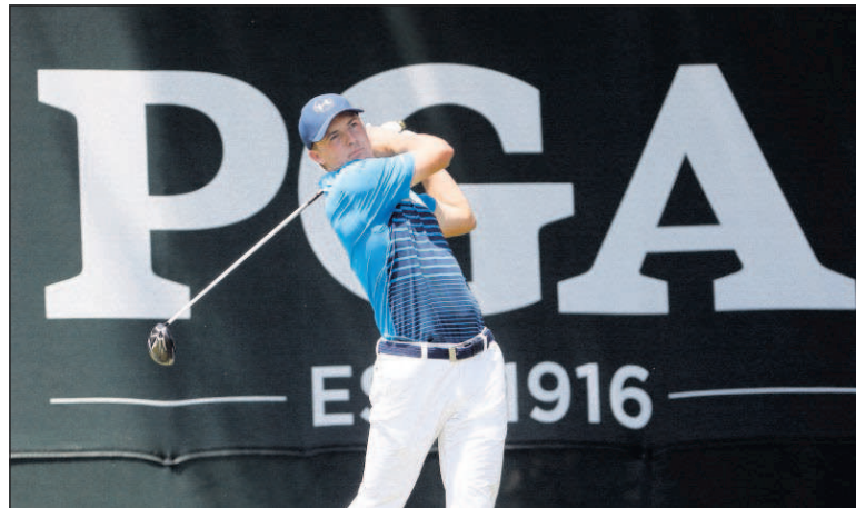
Jordan Spieth watches his tee shot on the first hole during the first round of the PGA Championship golf tournament at Baltusrol Golf Club in Springfield, N.J., Thursday, July 28, 2016.

Walker wound up with a one-shot lead over two-time major champion Martin Kaymer, Emiliano Grillo and Ross Fisher. Kaymer had the best score in the afternoon, when the blend of poa annua and bent grass on the Baltusrol greens became a little