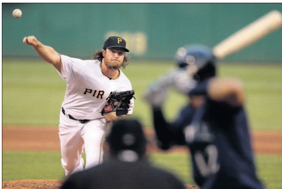
Pittsburgh Pirates starting pitcher Gerrit Cole delivers during the fourth inning of a baseball game against the Seattle Mariners in Pittsburgh, Wednesday, July 27, 2016.