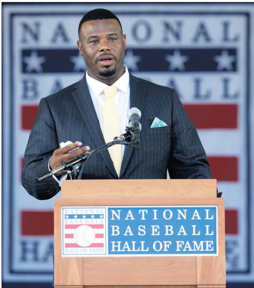
National Baseball Hall of Fame inductee Ken Griffey Jr. speaks during the induction ceremony at Clark Sports Center on Sunday, July 24, 2016, in Cooperstown, N.Y.