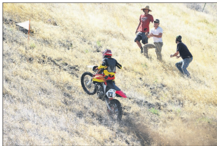
A rider attempts to keep his front tire down while competing in the Nitro in the Blues hill climb on Friday in Reith.

One reason it was such a success was because of the hill, which is located on a ranch one mile south of Rieth. It was labeled as an average hill compared to some on the