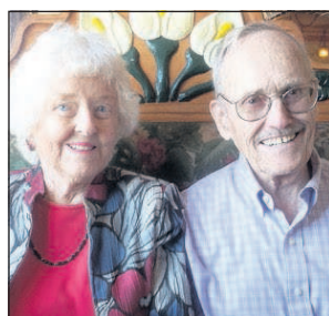
The Bagwells in 2016