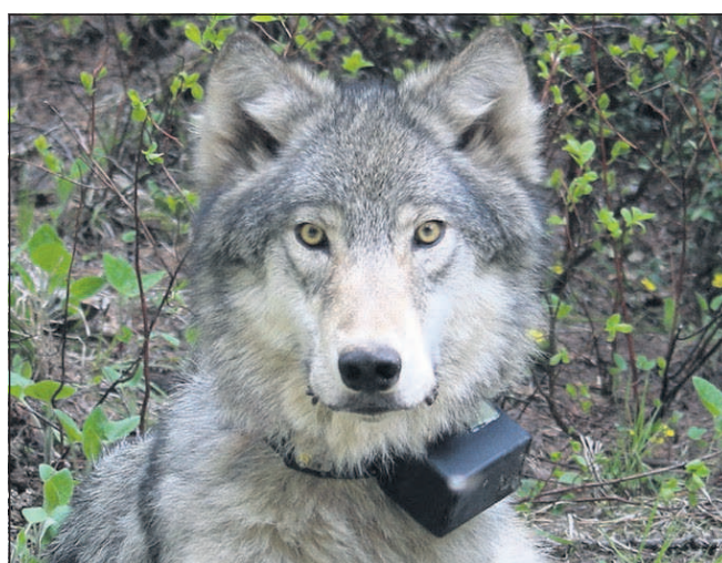
This 2014 file photo provided by the Oregon Department of Fish and Wildlife shows a female wolf from the Minam pack outside La Grande, after it was fitted with a tracking collar.

appeals court — and now revising its wolf management plan as required every five years.