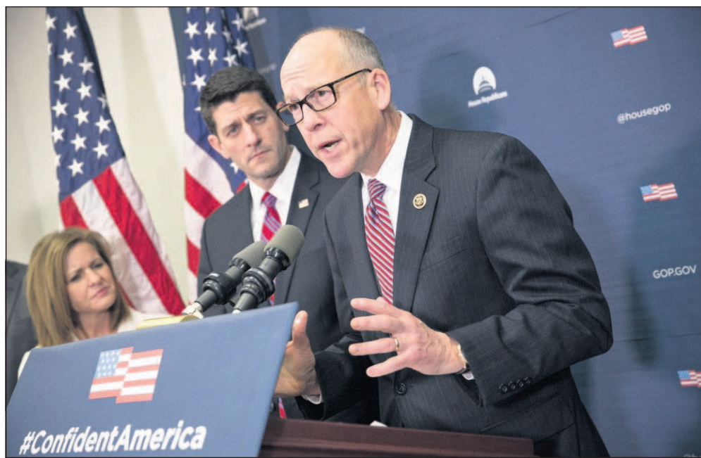
In this Jan. 6 file photo, Rep. Greg Walden, R-Ore., right, accompanied by House Speaker Paul Ryan of Wis., center, and Rep. Lynn Jenkins, R-Kansas, speaks during a news conference on Capitol Hill in Washington.

The Oregon Fish and Wildlife Commission took the wolf off the state endangered list in November — a decision wildlife advocates are currently fighting in