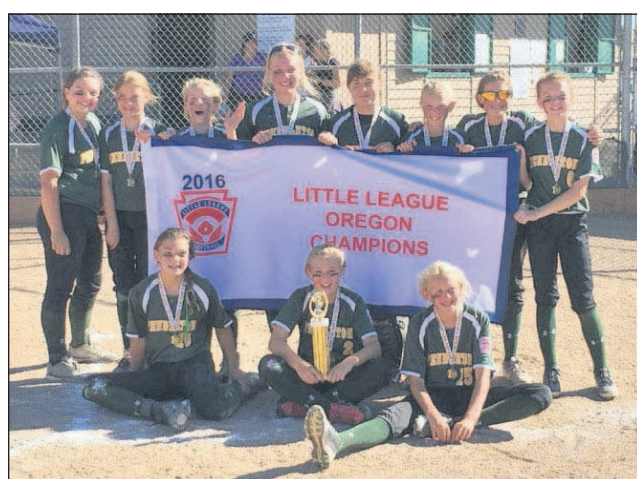
The Pendleton 11/12-year-old softball all-stars pose with their state-championship medals, trophy and banner after beating Southeast Portland 8-4 in the final of the Oregon Little League State Tournament on Wednesday in Redmond.

Contributed photo courtesy of Justin Samp