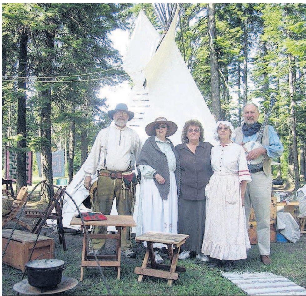
Heritage Days features muzzleloaders, woodcarvers, pioneer actors and the Blue Mountain Fiddlers Friday and Saturday at Emigrant Springs State Heritage Area.

include a cake walk and a raffle, with a chance to win seats for the Pendleton Round-Up.