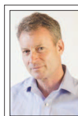
TIMOTHY EGAN Comment

The Republicans, on the verge of nominating a man with the temperament of a sociopath, someone who praises a murderous dictator while damning the American troops who fought him, should crack up and break