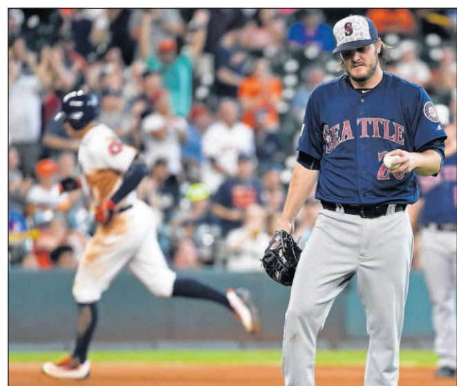
Seattle Mariners starting pitcher Wade Miley, right, looks away as Houston Astros' George Springer, left, rounds the bases after hitting a solo home run solo in the fifth inning of a baseball game, Monday, July 4, 2016, in Houston.

Kyle Seager hit a ground-rule double with one out in the second and the Mariners tied it on the single by Lee. McCullers settled in after that, retiring the next 14 in a row. He struck out eight in that span, including the side in the third.