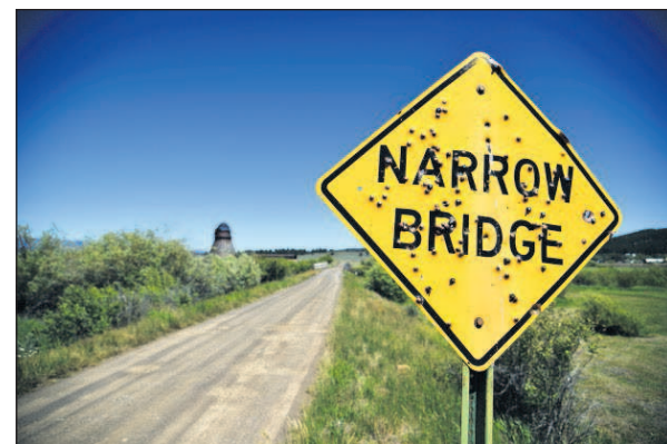
14 Mile 209.4 - A bullet-riddled road sign in Seneca on Highway 395.