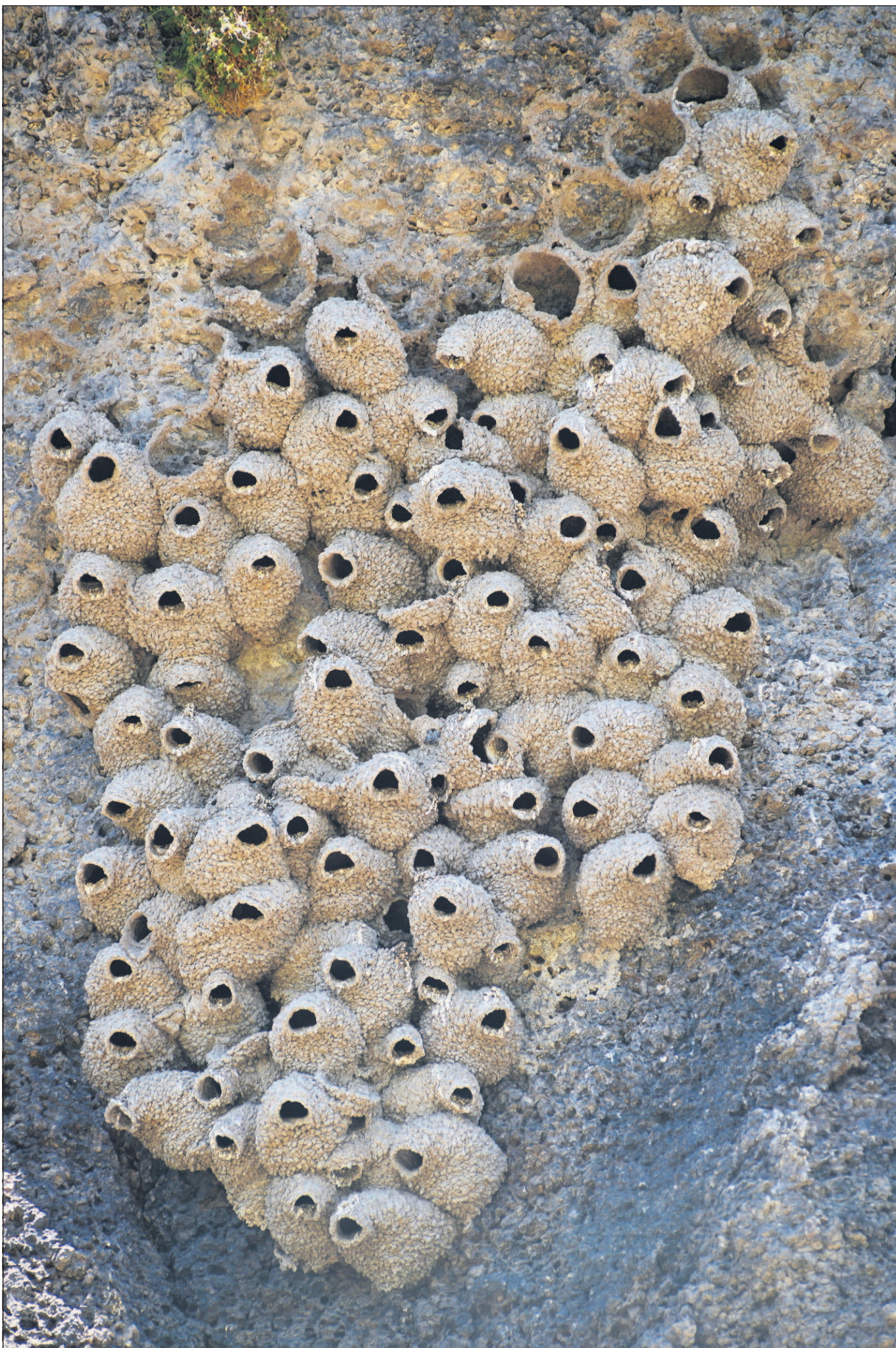
12 Mile 167.9 - A colony of mud birds' nests on a rock wall north of Burns on Highway 395.