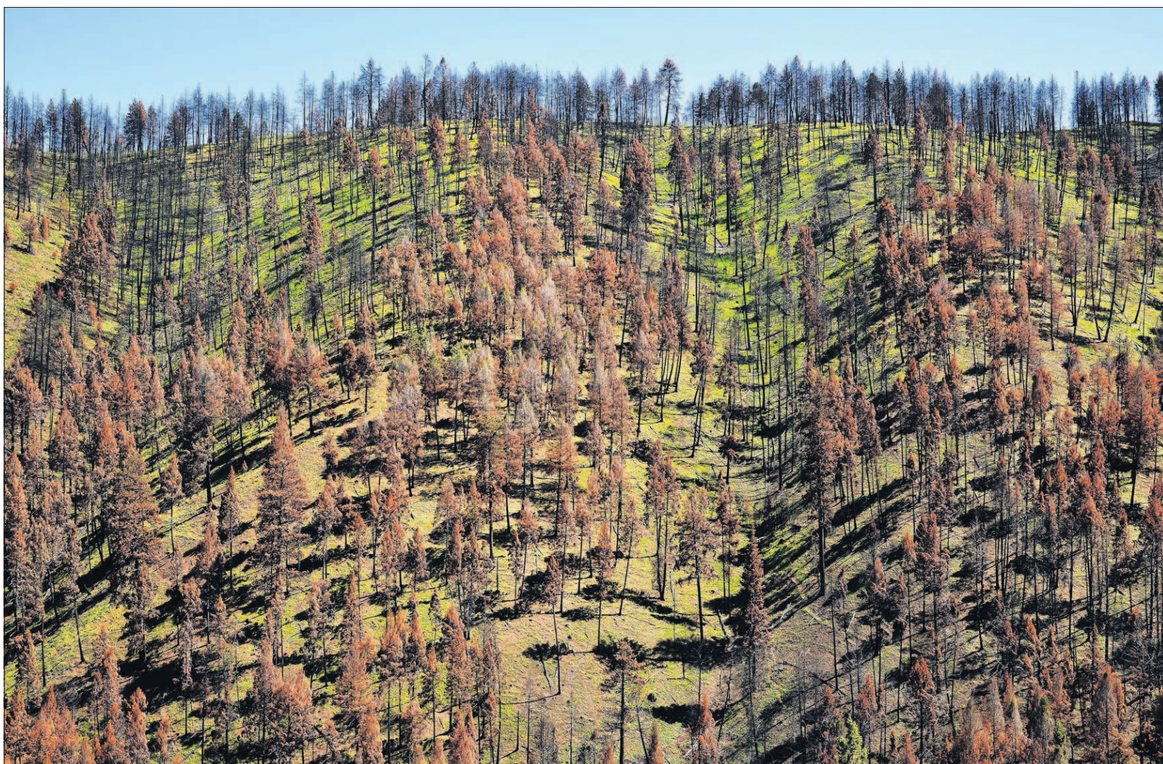
15 Mile 220.7 - New grass grows on hillside burned in last year's Canyon Creek Fire south of John Day on Highway 395.