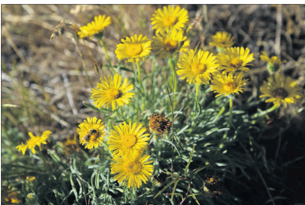
18 Mile 266.3 - A bee collects pollen from a wild daisy south of Fox.