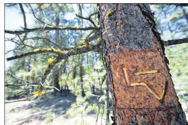
13 Mile 181.8 - A carving of the cattle brand for Robert "LaVoy" Finnicum near an impromptu memorial for the Arizona rancher near the spot he was killed south of the Silvies River on Highway 395.