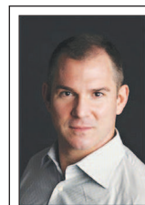
FRANK BRUNI Comment

But would Britain settle for them? The bloated pride that brought it to this juncture won't allow for a significant other that's too other and insignificant, and most outsiders can't locate Albania on a map. (Go south to the heel of Italy, turn left, cross the Adriatic, hope for the best.) There are better charted, more ego-salving corners of Europe that haven't bedded down with Brussels and are still on the market.