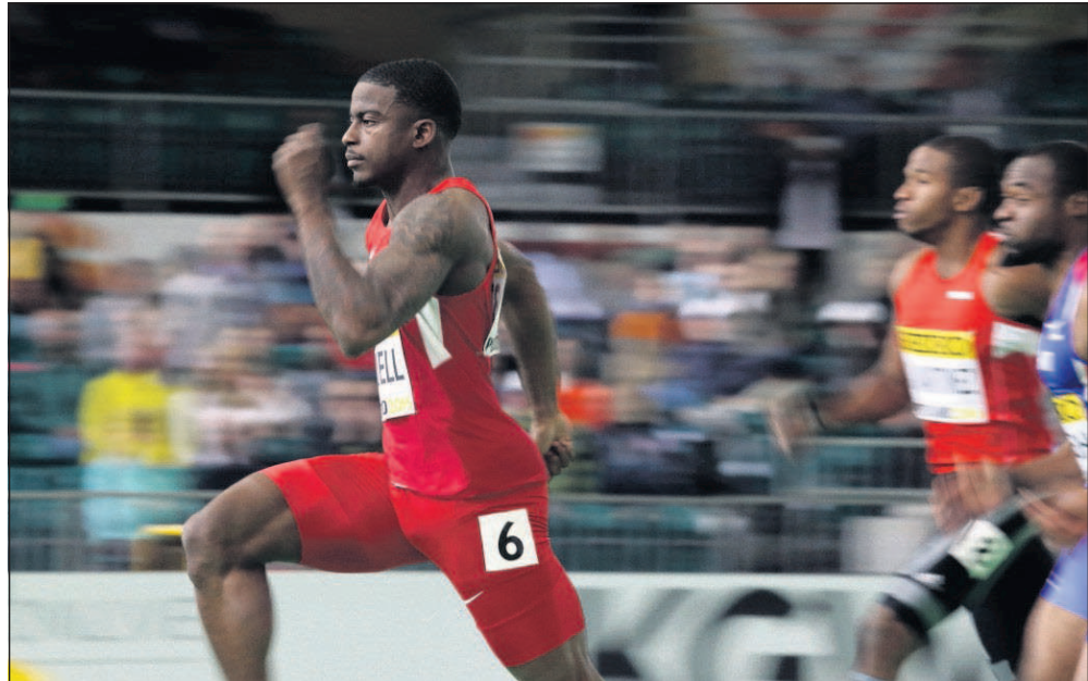
In this March 18, 2016, file photo, United States' Trayvon Bromell, left, pulls away from competitors to place first in a heat of the men's 60-meter sprint during the World Indoor Athletics Championships in Portland, Ore.