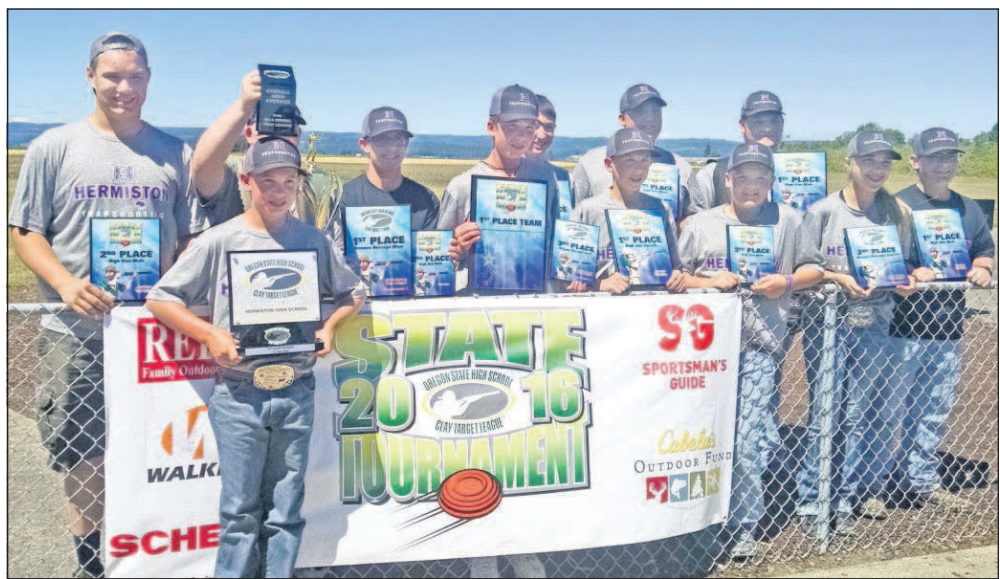
The Hermiston High School trap shooting team poses with its awards at the inaugural Oregon State High School Clay Target League State Tournament on Saturday in Hillsboro. Hermiston won the team title.