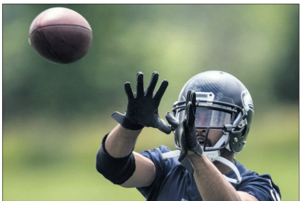
Seahawks wide receiver Doug Baldwin makes a catch during NFL football practice, Tuesday, June 14, 2016 at Virginia Mason Athletic Center in Renton, Wash.

Since going undrafted out of Stanford in 2011, Baldwin has developed into a premier wide receiver. He has seen his receiving numbers increase every season despite getting fewer targets than most top wide receivers in the NFL. Baldwin's 78 receptions last season came on 103 targets, which ranked 38th in the league.