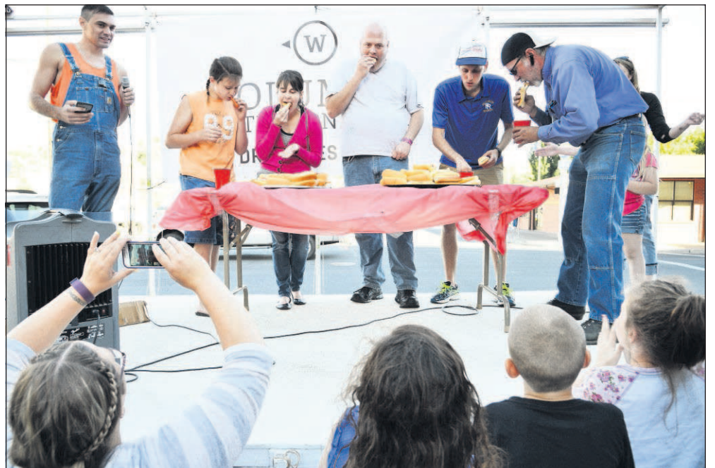
Contestants chow down while competing in the hot dog eating contest during the Dogtuna 400 wiener dog races Friday in Pendleton.