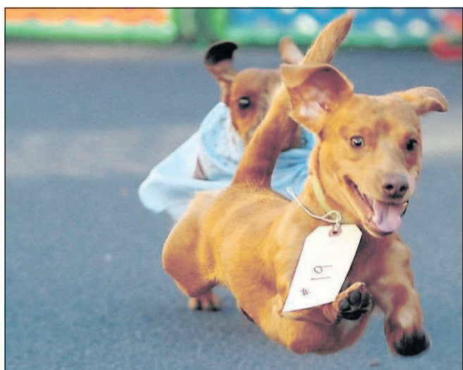
The annual Wiener Dog Races are at 4 p.m. in the 400 block of South Main Street, Pendleton. The event also includes children's activities, vendors and gourmet hot dog and hot dog eating contests.