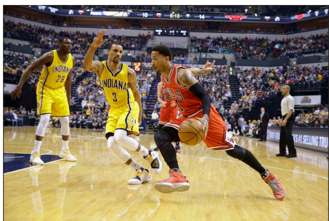
In this March 29, 2016 file photo, Chicago Bulls guard Derrick Rose (1) drives on Indiana Pacers guard George Hill (3) during a game in Indianapolis.

But he wrecked his knee for the first time in the playoffs the following year and no longer has the speed that once made him one of the league's most dazzling young stars and a seemingly perennial All-Star.