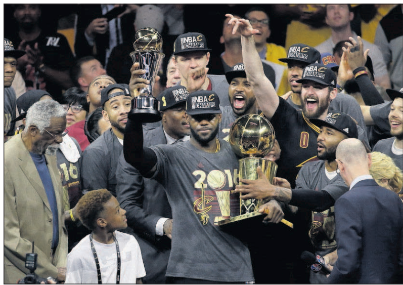
Cleveland Cavaliers forward LeBron James, center, celebrates with teammates after Game 7 of basketball's NBA Finals against the Golden State Warriors in Oakland, Calif., Sunday, June 19, 2016.