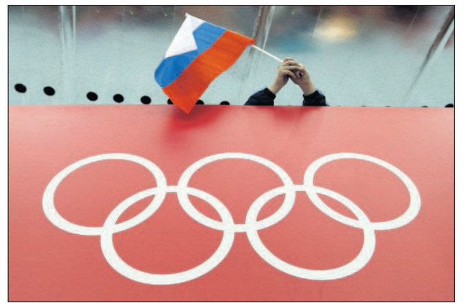
In this Feb. 18, 2014, file photo, a Russian skating fan holds the country's national flag over the Olympic rings before the start of the men's 10,000-meter speedskating during the 2014 Winter Olympics in Sochi, Russia.