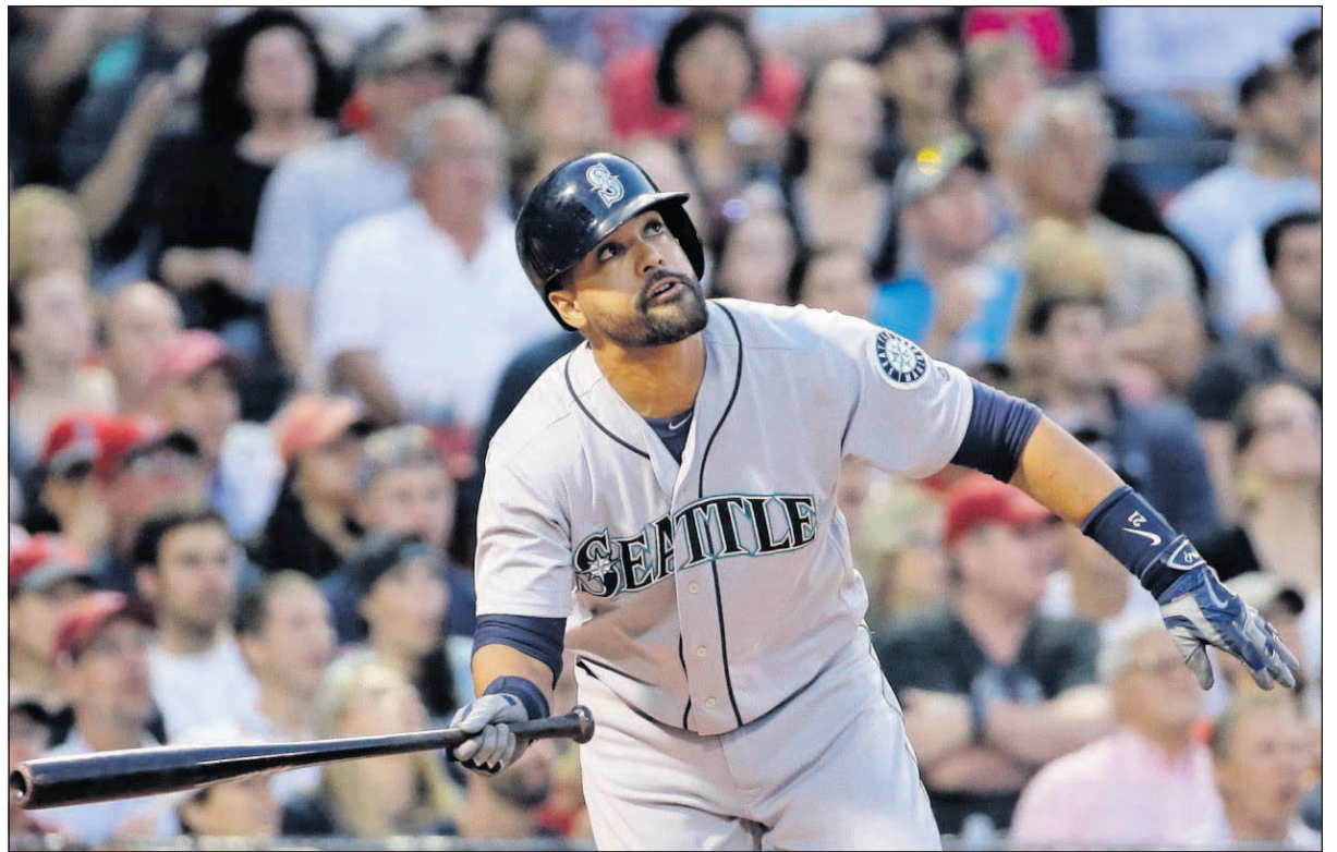
Seattle Mariners' Franklin Gutierrez watches his three-run double during the fourth inning of a baseball game against the Boston Red Sox at Fenway Park on Friday, June 17, 2016, in Boston.